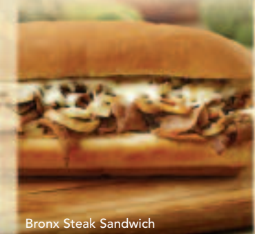
Bronx Steak Sandwich

Complete Menu Online www.meetatmarys.com