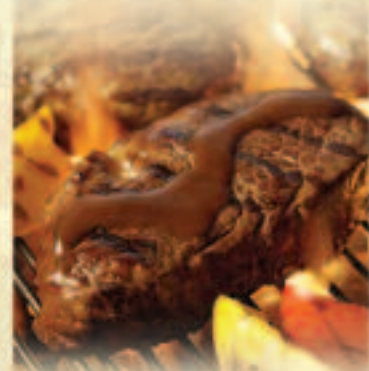
Charbroiled Filet Mignon with Demi-Glace