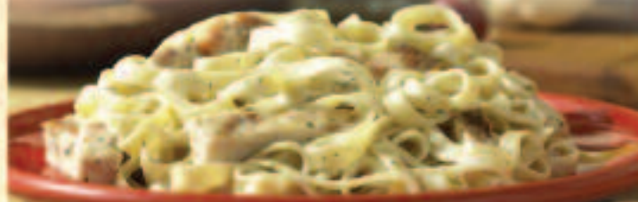
Fettuccine Alfredo with Chicken

All Dinner Entrées include your choice of a fresh-tossed garden salad coleslaw or apple sauce & baked Italian bread.