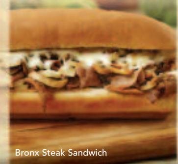
Bronx Steak Sandwich