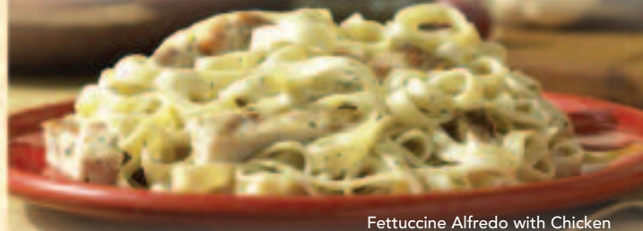
Fettuccine Alfredo with Chicken

All Dinner Entrées include your choice of a fresh-tossed garden salad coleslaw or apple sauce & baked Italian bread.