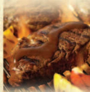
Charbroiled Filet Mignon with Demi-Glace