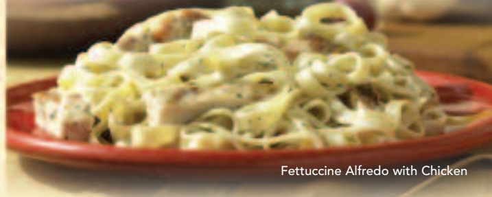
Fettuccine Alfredo with Chicken

All Dinner Entrées include your choice of a fresh-tossed garden salad coleslaw or apple sauce & baked Italian bread.