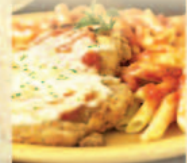
Italian Crumbed Chicken