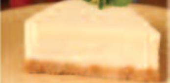
Mary's NY Cheesecake