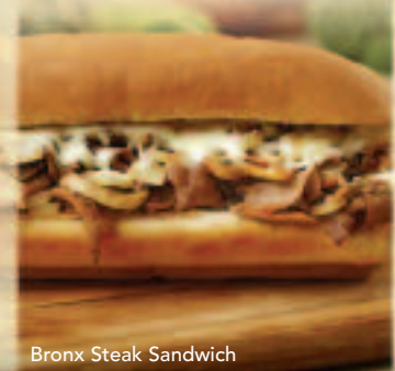
Bronx Steak Sandwich

Complete Menu Online www.meetatmarys.com