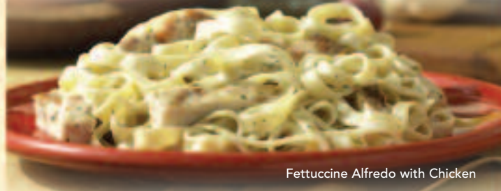
Fettuccine Alfredo with Chicken

All Dinner Entrées include your choice of a fresh-tossed garden salad coleslaw or apple sauce & baked Italian bread.