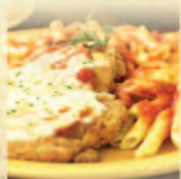
Italian Crumbed Chicken