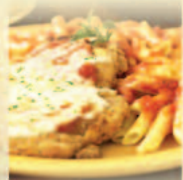
Italian Crumbed Chicken