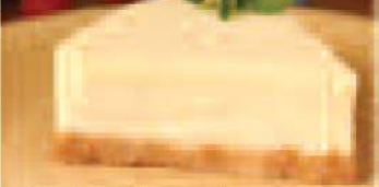
Mary's NY Cheesecake

GIFT CERTIFICATES AVAILABLE! Fast, Free Shipping Nationwide