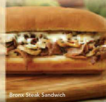
Bronx Steak Sandwich