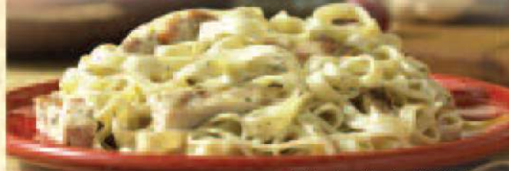
Fettuccine Alfredo with Chicken

All Dinner Entrées include your choice of a fresh-tossed garden salad coleslaw or apple sauce & baked Italian bread.