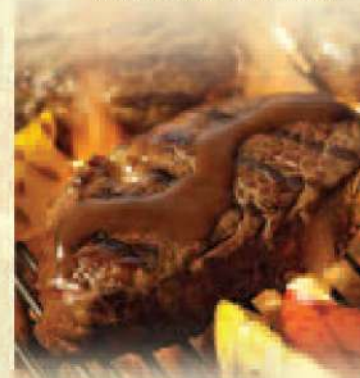
Charbroiled Filet Mignon with Demi-Glace