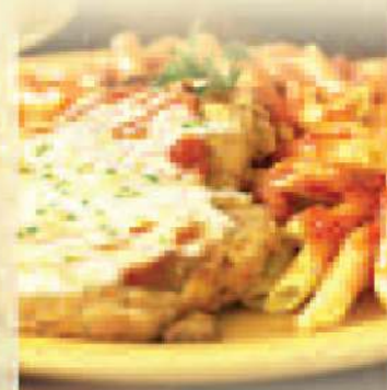
Italian Crumbed Chicken

The Sicilian Trio Our Four Cheese Lasagna, Italian Crumbed Chicken Breast & Pasta Marinara. 16.95 Substitute Pasta Alfredo for 1.00